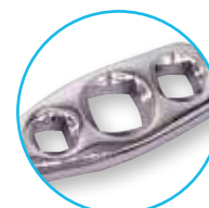
Misure chiave fisse 8.5-9.5-13mm