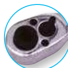
Ratchet measures 1/4"-5/16"